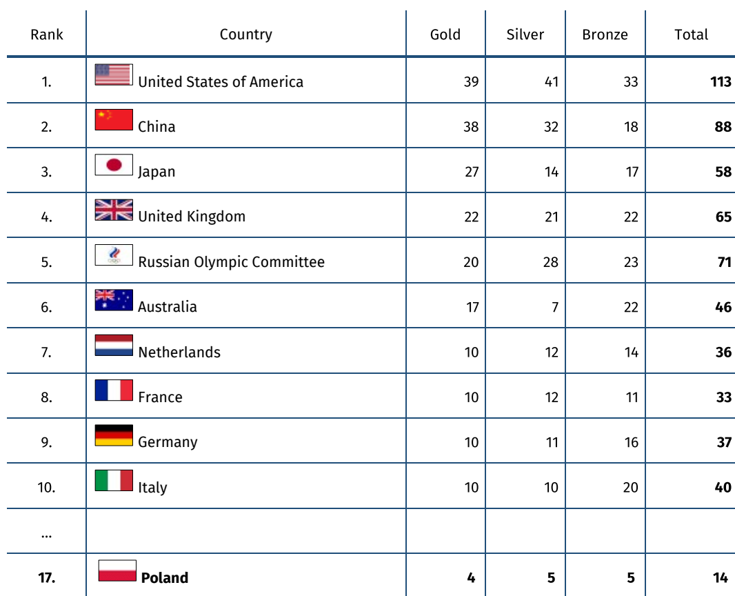
Table 1. Medal classification of the XXXII Tokyo 2020 Olympic Games